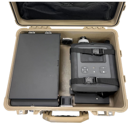
MX908 Beacon accessory for remote area monitoring